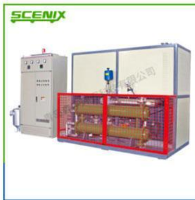
Electrical Heating Oil Heat Furnace