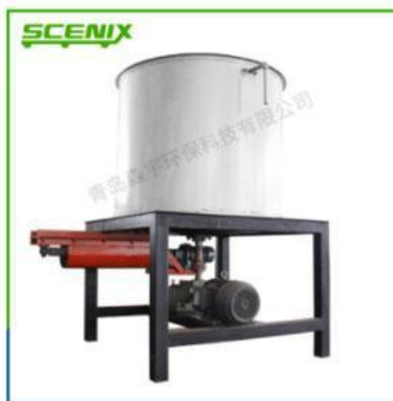
Glue mixing machine